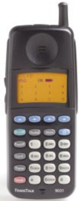
TransTalk Pocket Phone 9031 handset.

By taking advantage of a new standard of digital transmission and utilizing spread-spectrum frequency hopping, the Lucent Technologies TransTalk Wireless System provides security and reliability on every call.