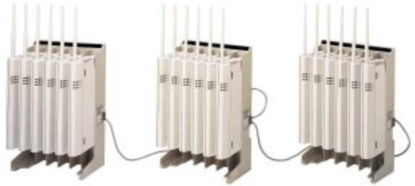
TransTalk 9000 Digital Wireless System Carriers configured for 18 users. 2